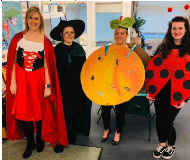
Our wonderful staff team

Thank you to everyone for your fantastic support on World Book day, your children looked amazing! We hope you all enjoyed the photos on homeroom...here are a few to enjoy!