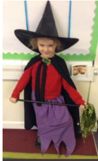
Year 2 - A character from a ROALD DAHL book