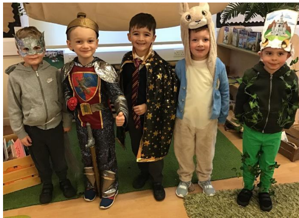
Year 1 – A character from a JULIA DONALDSON book