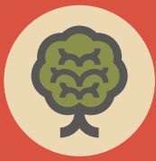
Reception – Focus - A traditional story character