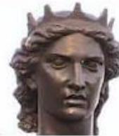
Queen Boudicca – led the rebellion against the Romans