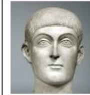
Emperor Flavius Honorius – wrote to Britain following Roman withdrawal