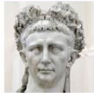
Emperor Tiberius Claudius – led Roman conquest of Britain