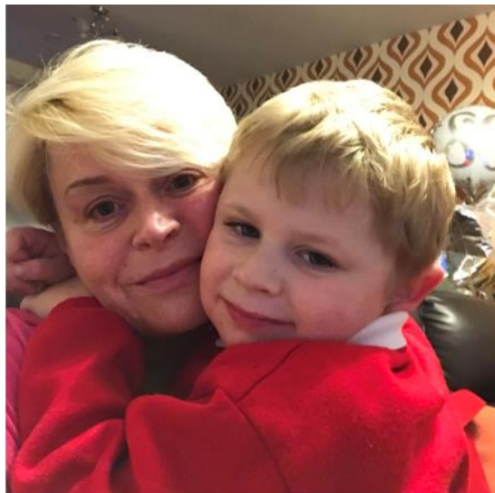
Giving mommy a hug as she felt poorly after an Operation