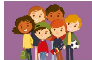
Children's social care Learn more