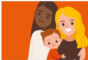
Fostering Learn more