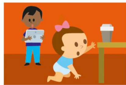
Keeping you and your children safe Learn more