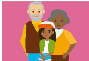
Adoption Learn more