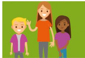
Services for children and young people Learn more