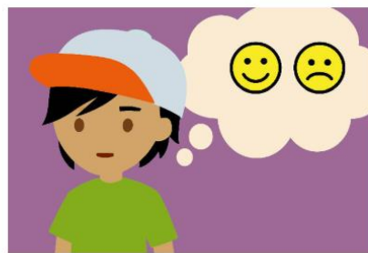
Mental health and wellbeing Learn more