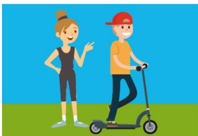
Health and wellbeing Learn more