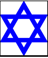
Star of David—Jewish symbol